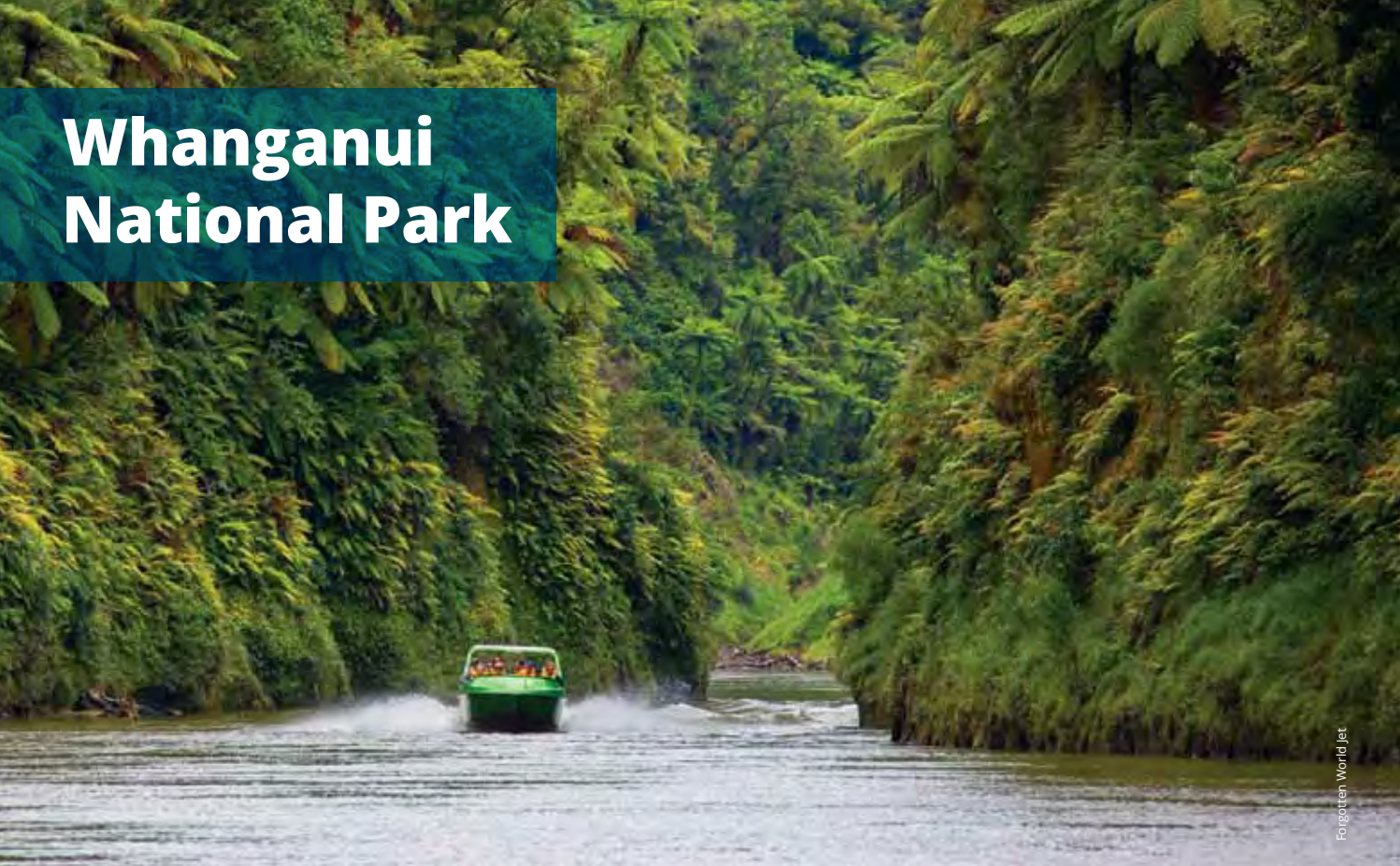
Forgotten World Jet

Discover rich human history, an array of natural wonders, and your own sense of adventure in the remote wilderness within Whanganui National Park.