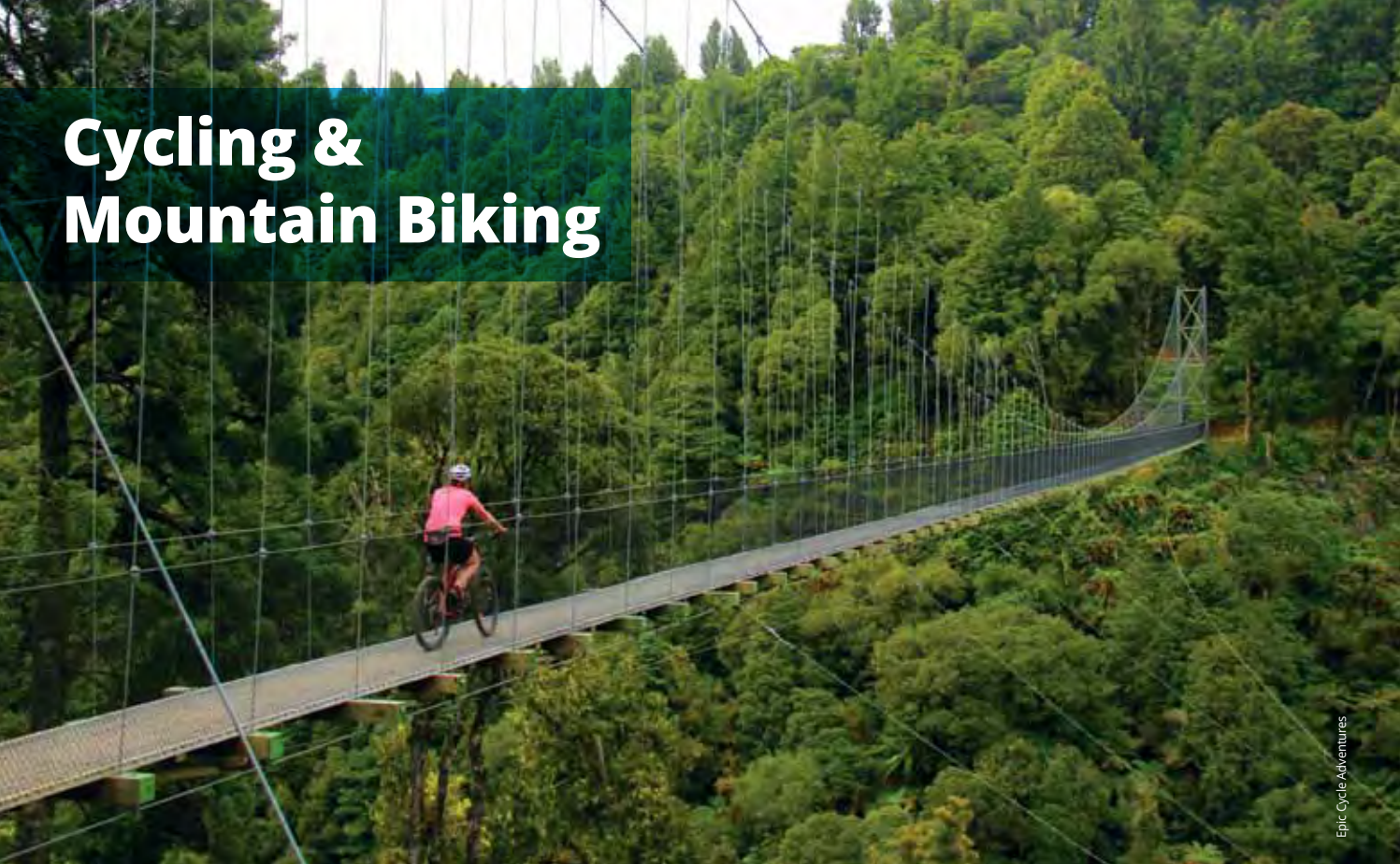
Epic Cycle Adventures

An enviable network of cross-country trails – complete with awesome scenery and varied terrain – have cemented Ruapehu as one of New Zealand's best mountain biking destinations.